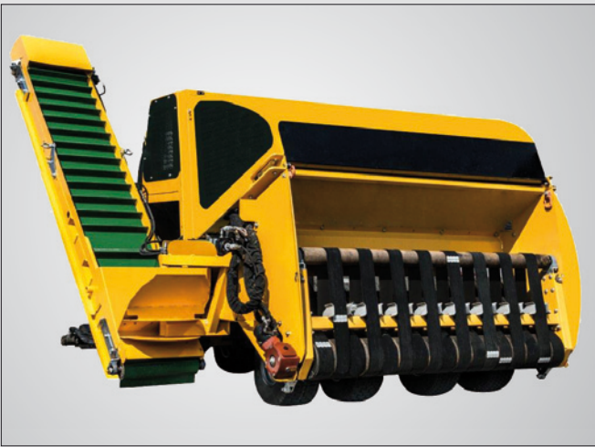
Conveyer 180° traversable