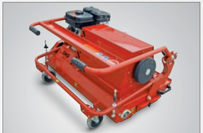
Foldable steering arm for easy transport and storing in a small place