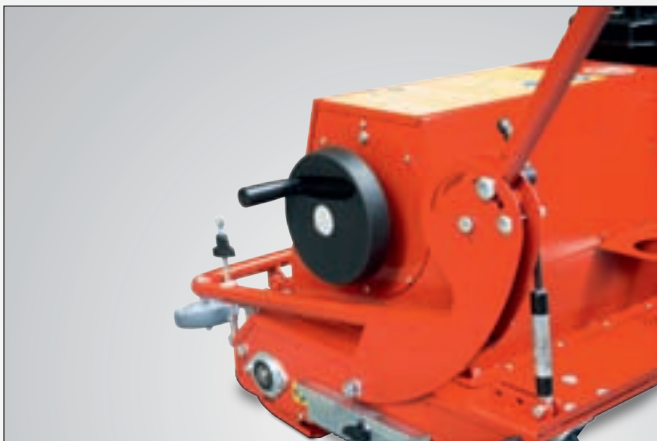
Hand wheel to clean the permanent filter