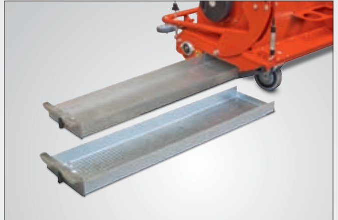
Extractable filter sieve several sieves available