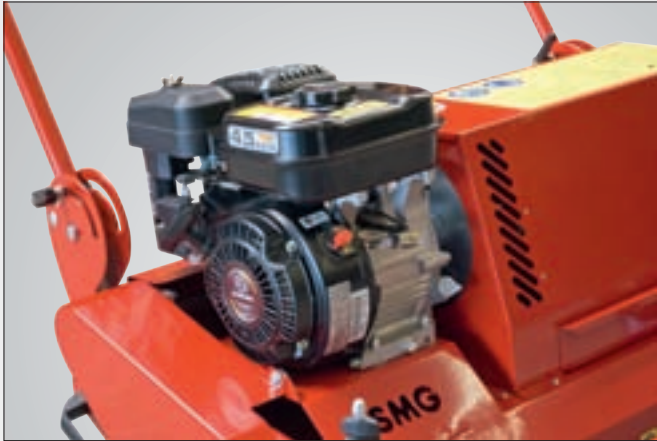
1-cylinder petrol engine for brush and turbine