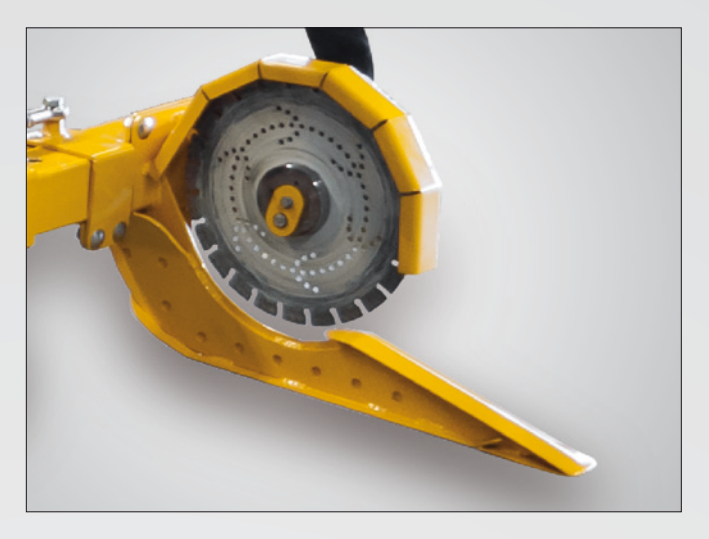
350 mm saw blade