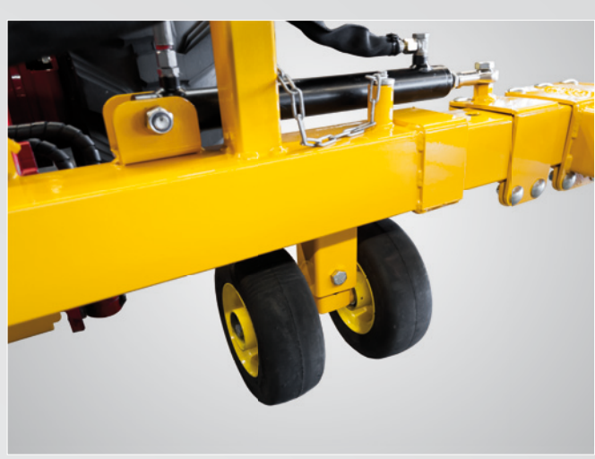
support wheel and guide